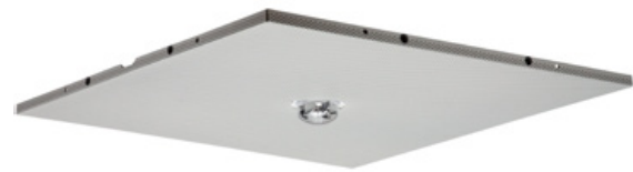
Speaker Strobe shown (as installed and close-up)